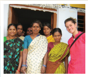
Jennifer in India, 2006 (IMM)

Visit akfc.ca/youthfellows for more information and application procedures.