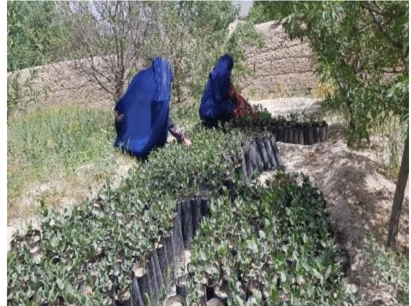
Women farmers during & after nursery intervention