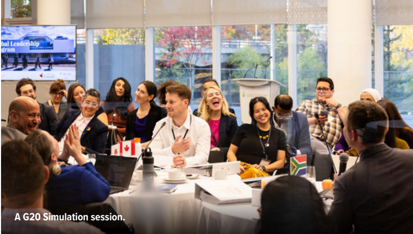
A G20 Simulation session.