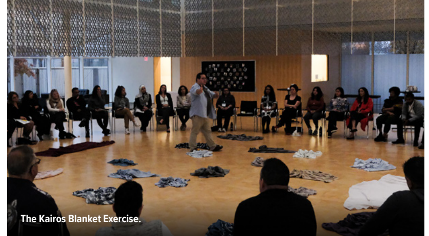
The Kairois Blanket Exercise.

In today's complex and interconnected world, leadership requires a global perspective.